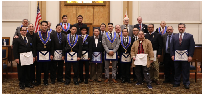
Brothers after the stated meeting dinner before meeting