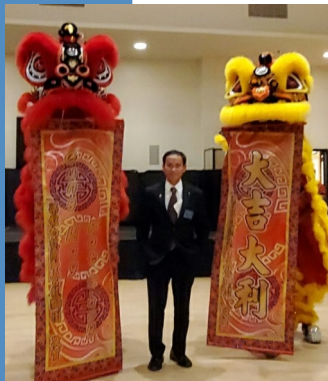
A Lunar New Year Celebration at dinner