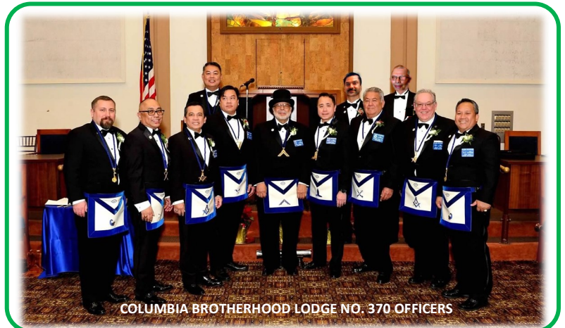
COLUMBIA BROTHERHOOD LODGE NO. 370 OFFICERS