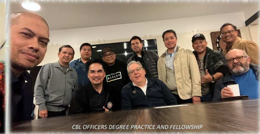
CBL OFFICERS DEGREE PRACTICE AND FELLOWSHIP