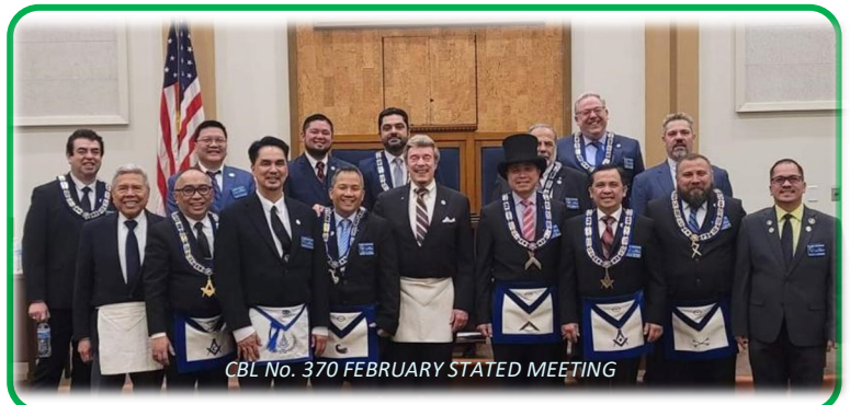
CBL No. 370 FEBRUARY STATED MEETING