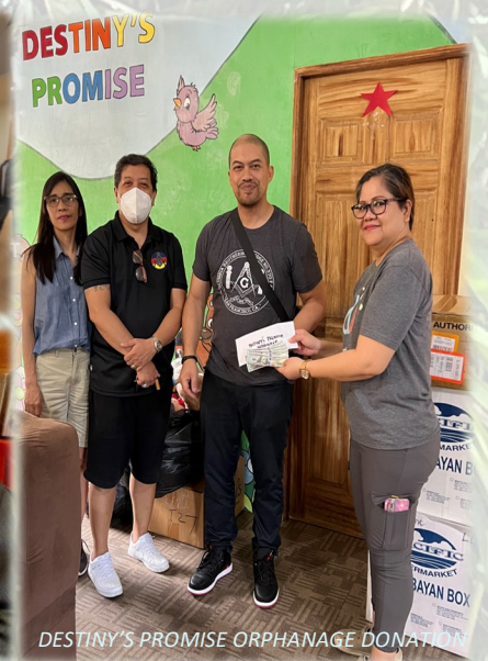
DESTINY'S PROMISE ORPHANAGE DONATION