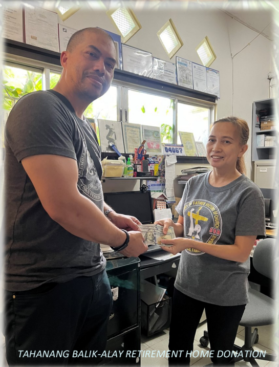
TAHANANG BALIK-ALAY RETIREMENT HOME DONATION