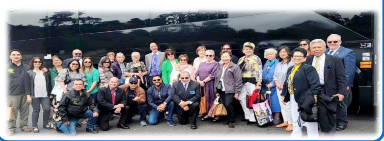
CBL NO. 370 - WIDOWS APPRECIATION DAY 2023AY