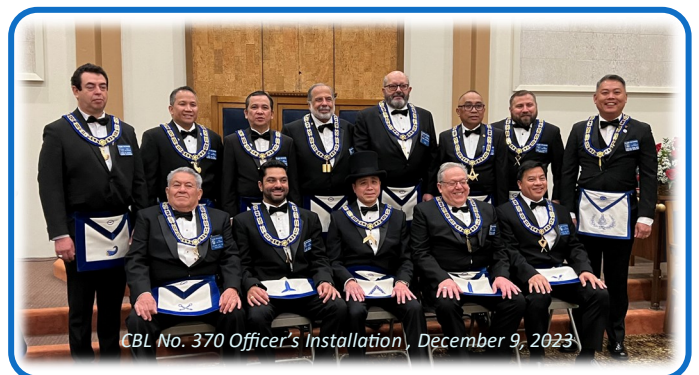
CBL No. 370 Officer's Installation, December 9, 2023