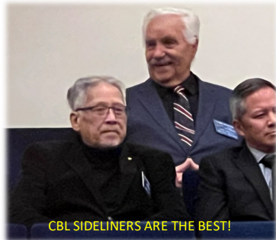
CBL SIDLINERS ARE THE BEST!