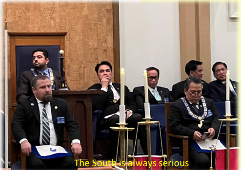
The South is always serious