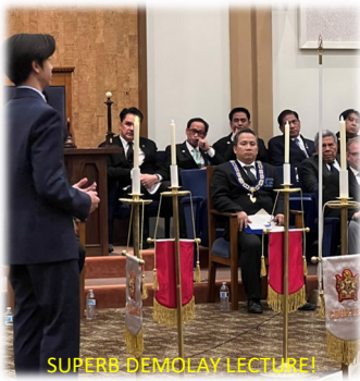
SUPERB DEMOLAY LECTURE!